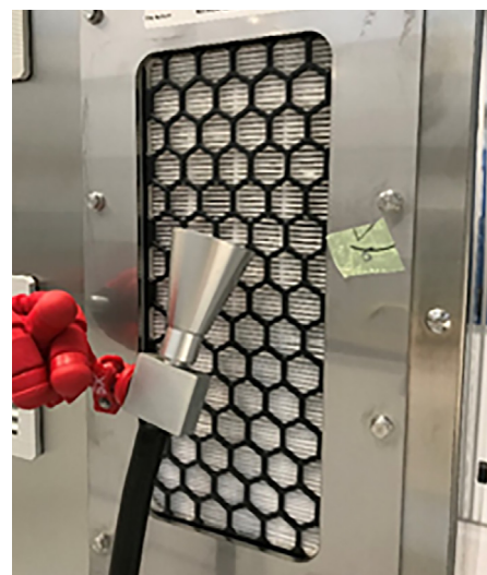
Figure 5. MP 6, on the back of Heracell Vios 160i CR, close to the HEPA filter.