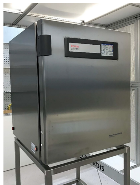
Figure 3. Heracell Vios 160i CR and Heracell Vios 250i CR incubators photographed during the initial visual inspection and cleaning.