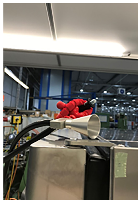
Figure 6. Heracell Vios 160i CR at the highest emission point MP 3, located on the upper right side, above the top door hinge.