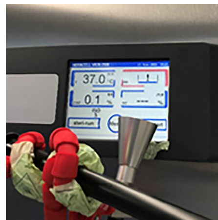
Figure 4. MP 2 near the right corner of the display on Heracell Vios 250i CR unit.

The goal was to achieve the calculated value of “z” larger than 1.645, which meant that the class limit G (here, G is the maximum number of particles permitted within ISO Class 5) could not be exceeded with the confidence level of 95 %. Per ISO 14644-14:2016, these CO 2 incubators could then be considered compatible with an ISO Class 5 environment at the particle size ranges of 0,5 µm and larger and 5,0 µm and larger (5,6).