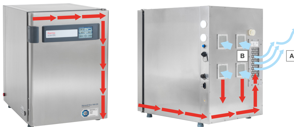
Figure 2. Overview of the process used to test CO 2 incubator suitability for use in a cleanroom, in accordance with ISO 14644-14: 2016. A measuring point with the highest particle emissions detected was located at the upper right side, above the top door hinge. This point was used for the final ISO class compatibility determination.